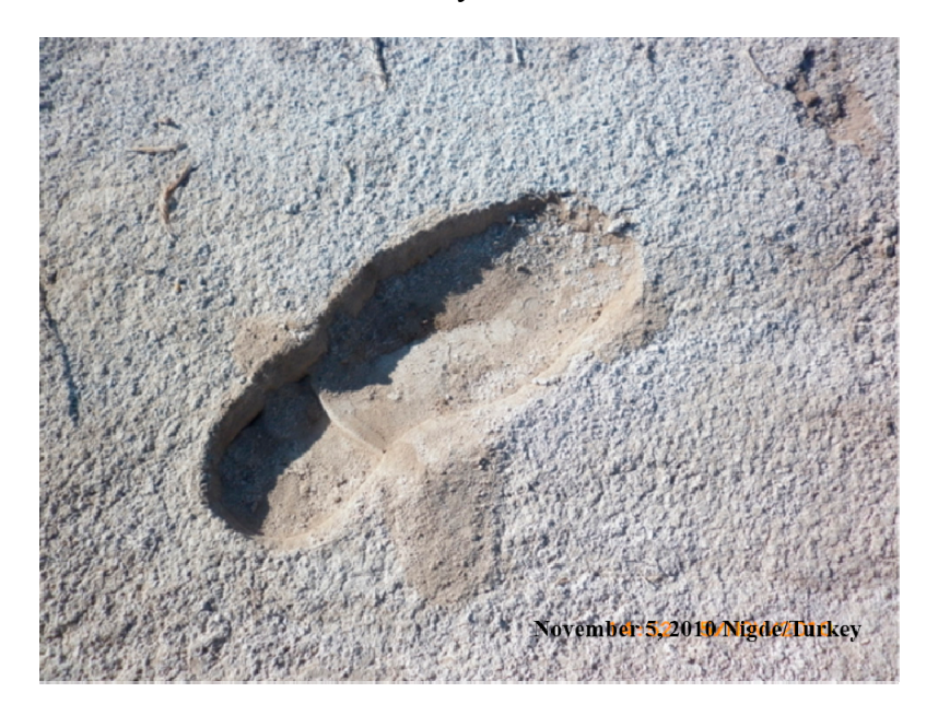
Figure 4. Intensive tillage of saline soils in arid soils increases capillary rise of salts to soil surface.

Salinization and waterlogging are serious problems, especially in areas where large but poorly managed irrigation systems were constructed. Applying excess irrigation water in the absence of a well maintained drainage system may cause the water table to rise and can also result in an increase in secondary soil salinity. To avoid worse effects, strict land use (e.g., avoid deep ploughing) and water management (e.g., no irrigation, using good quality irrigation water, and keeping the water table down) practices must be followed. Intensive tillage of saline soils in arid regions will destroy aggaegates, increase the capillary rise of salts to soil surface and eventually leave soils vulnarable to wind erosion (Figure 4).