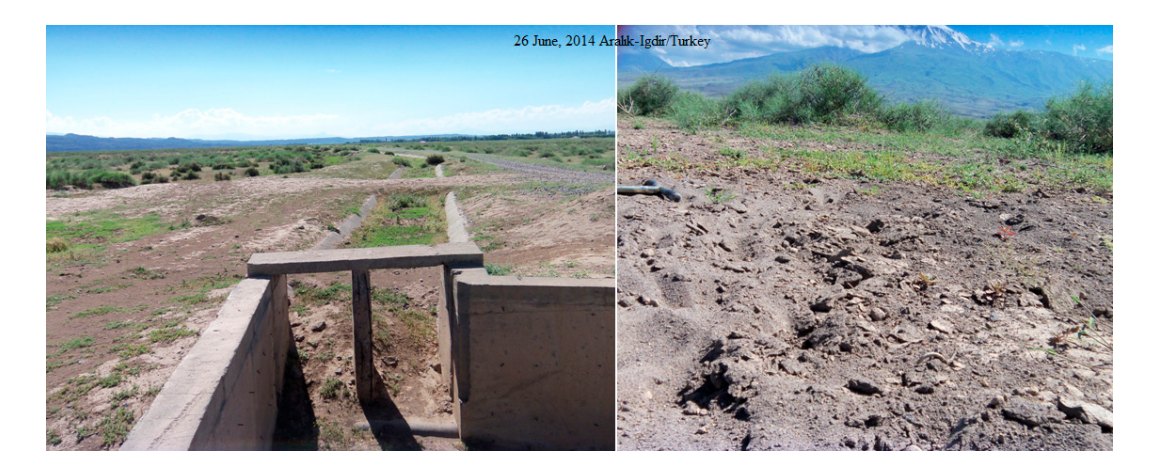
Figure 2. Severe wind erosion, sediments filled the irrigation channel in Aralik-Igdir/Turkey.

Wind erosion is site-specific, especially for the southern part of Romania. The absence of irrigation and the uncontrolled deforestation of protection belts accelerated the northward extension of desertification-affected surfaces and movement of sand dunes. It has also been conducive to depletion of arable-land productivity and, in time, abandonment of those lands [13].