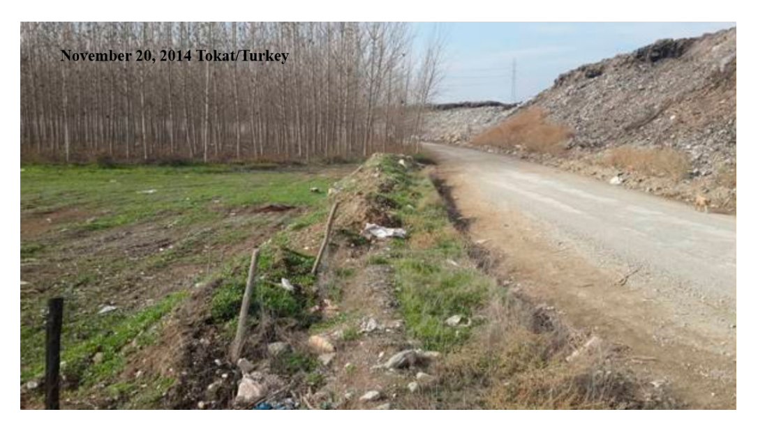
Figure 5. Open dumping of municipal wastes at the edge of agricultural fields in Tokat Province of Turkey.

Occupation of high quality land for settlements and industrial purposes in Turkey has almost reached 172,000 ha [72].