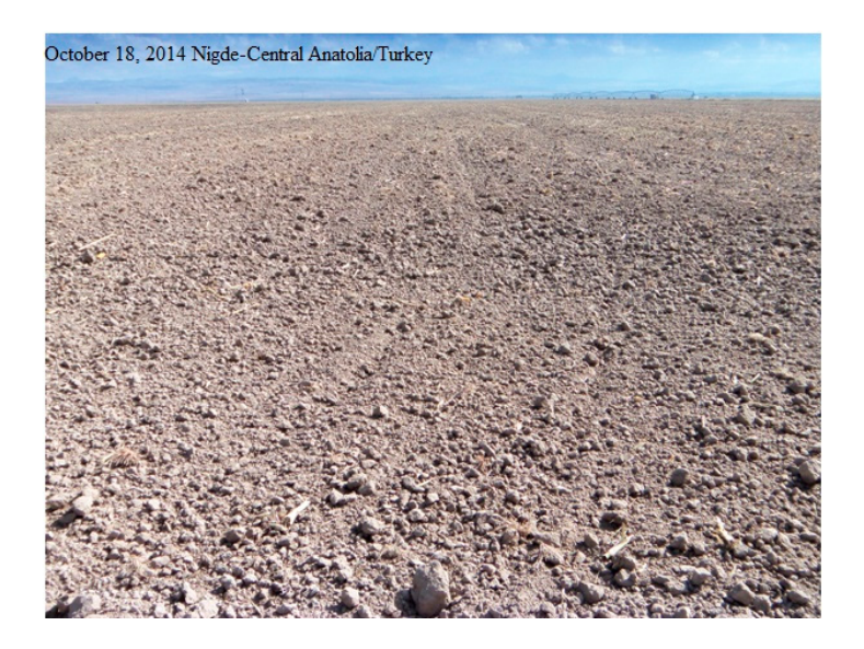
Figure 6. Fallow-wheat system applied in Central Anatolia.