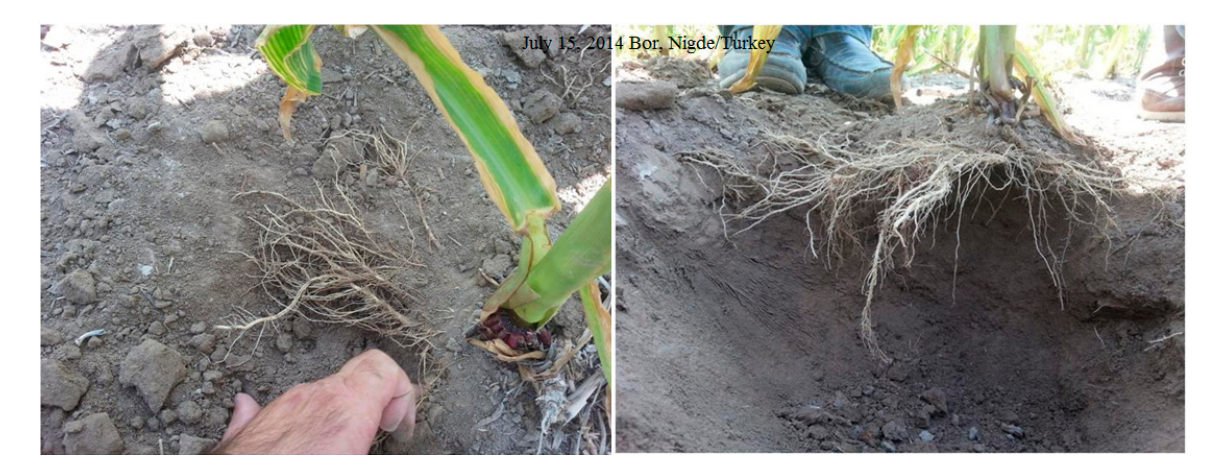
Figure 3. Subsoil compaction severely constrains root growth.

Subsurface soil compaction occurs as a result of the forces applied when agricultural machineries are used on the field [56]. Deep soils with less than 25% clay content are the most sensitive to subsoil compaction [59]. In contrast to the compaction of surface soils, subsurface compaction cannot easily be reversed and may last longer until broken by a ripper [60]. In many CASEE countries, compaction became a very serious degradation agent as the size and weight of farm machinery increased. For example, since 1955 the mass of tractors and tillage implements have increased by 68% and 200%, respectively, in the Czech and Slovak Republics [1].