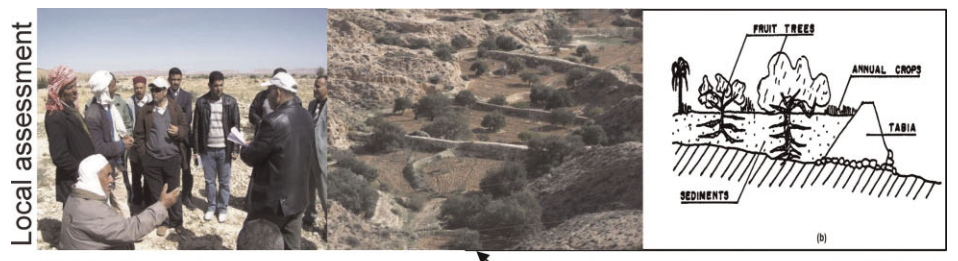
WOCAT SLM Technology and Approach documentation of water harvesting, e.g. Jessour (LADA local level assessment, DESIRE test implementation and monitoring).