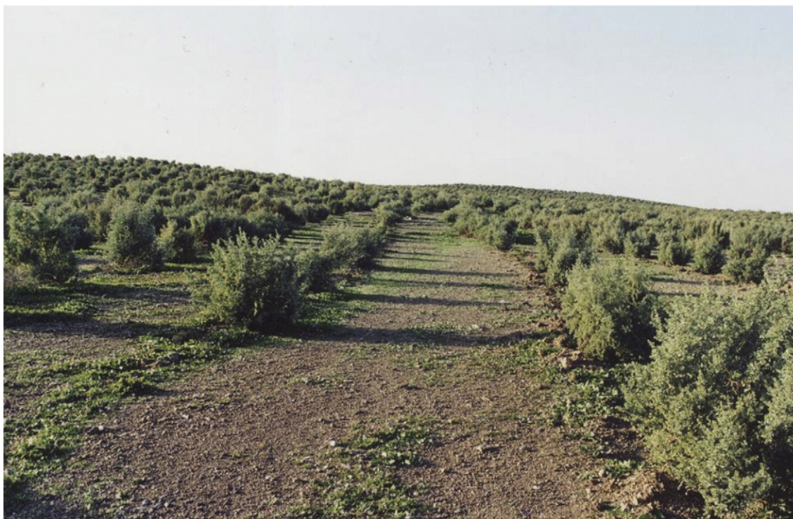
Fig. 2. Panoramic view of an Atriplex nummularia plantation in one of the study sites (Abda Skarna site; Ouled Dlim, Marrakech).

c According to WRB classification (FAO/ISRIC/ISSS, 2006).